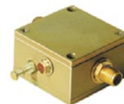
CASE STYLE: Y460